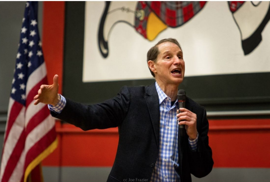
Sen. Ron Wyden hosts a Portland town hall in 2017.

Wyden will be speaking about the pressure he's putting on the tech giant at TechfestNW this Friday.