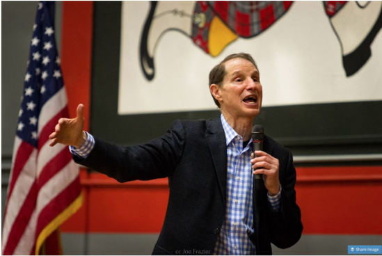
Sen. Ron Wyden hosts a Portland town hall in 2017.

On the same day a Russian agent is indicted for political activity, Trump administration loosens reins on foreign donors.