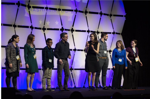
Nonprofit Technology Professional Certificate recipients on stage at the 2017 Nonprofit Technology Conference.

Non-Profit Technology Network March 31, 2017